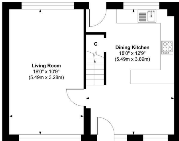
Ground Floor Approximate Floor Area 429 sq. ft (39.85 sq. m)